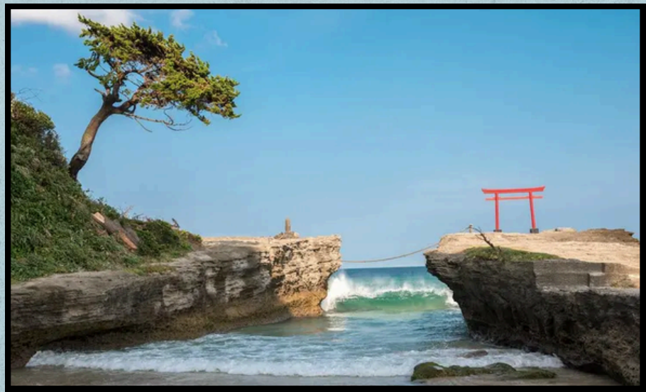
Shirahama Beach on the Izu Peninsula

July in Japan marks the beginning of a very sunny and hot season with intense temperatures and humidity. Respectively, such weather makes it a perfect time for a trip to the beach! In Japan, the water is “never far away” since it frames the archipelago from all sides – Pacific Ocean to the east, and the Sea of Japan to the west. The country consists of more than 6000 islands, meaning that the beaches are countless and diverse. They vary from rocky to sandy, depending on which part of Japan you are visiting. The weather varies as well. The subtropical Okinawa in the