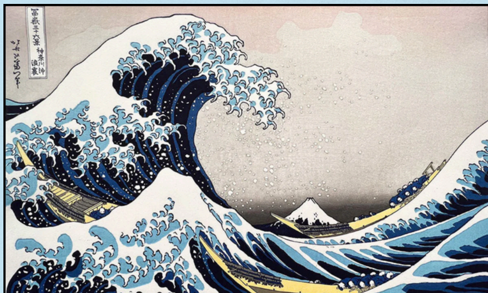
Hokusai. "The Great Wave off Kanagawa". 1831

The Seigaiha – a traditional Japanese pattern of the overlapping ocean waves seen on summer kimonos (yukata), pottery, and other crafts.