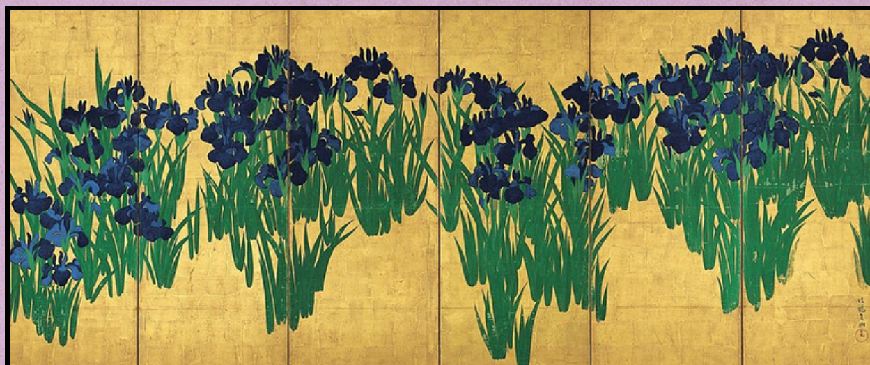
Ogata Kōrin. “ Iris es” (紙本金地著色燕子花園). c. 1701–1705

* You can also say “ hanashōbu-iro ” (花菖蒲色) and be understood, however, it is more common to say “ shōbu-iro ” since that form was established long ago as a traditional colour name. The term “ hanashōbu ” emerged later.