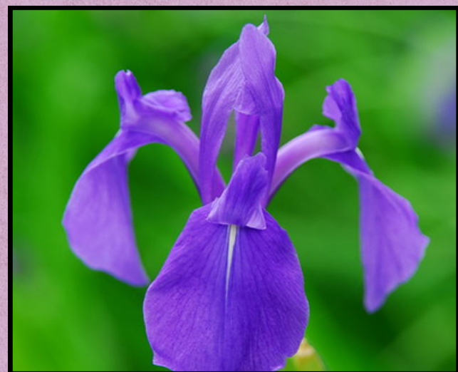
Kakitsubata ( Iris laevigata )