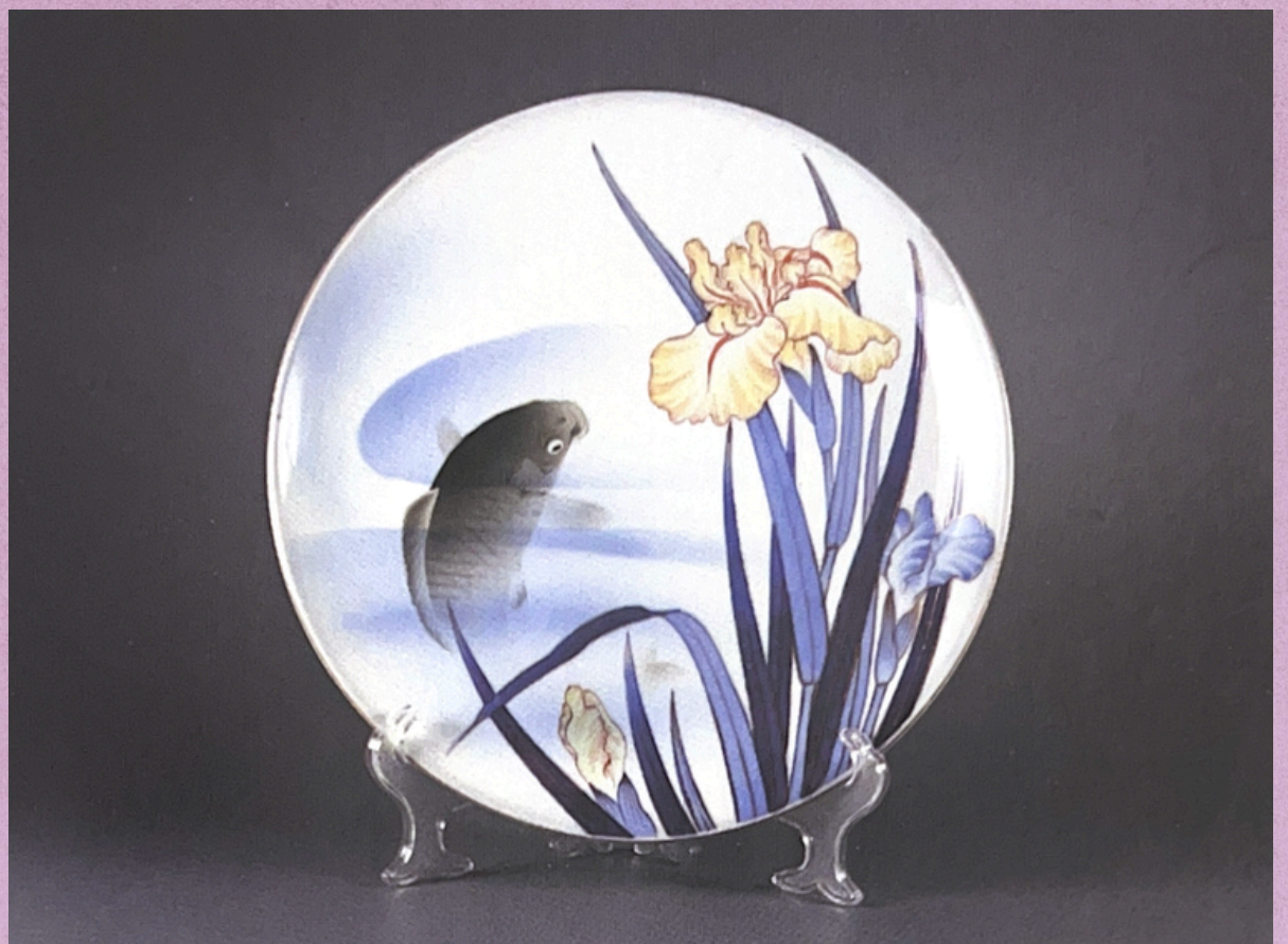
Plate. Porcelain. Japan. Turn of the 20th century.