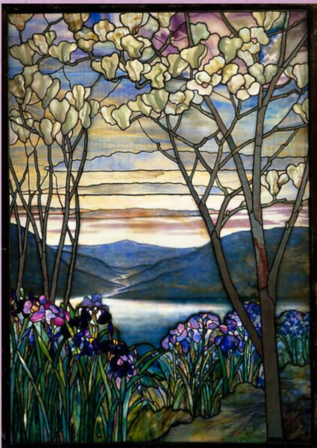
Louis C. Tiffany. " Magnolias and Irises ". 1905

Irises were well-known in ancient civilizations, however, the Art Nouveau period was the time when iris became the "cult flower" and was one of the most depicted in art. 1