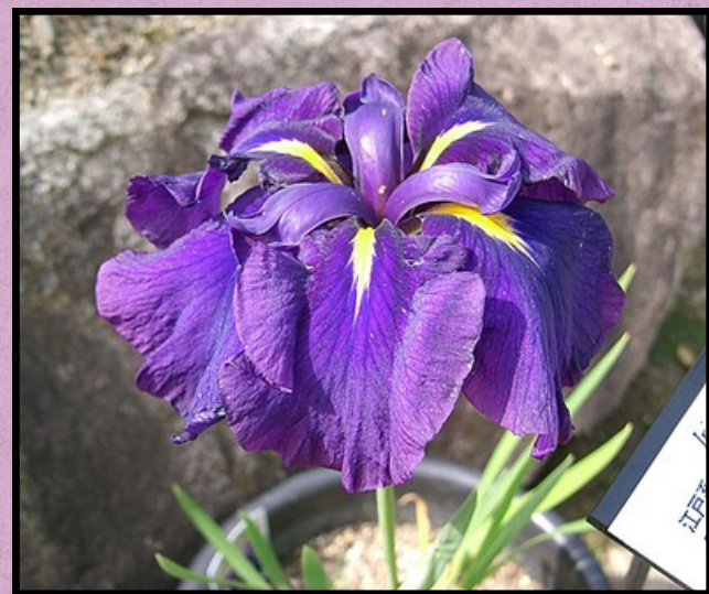
Hanashōbu ( Iris ensata )

Fun fact: in order to refer to a specific “iris” colour, all you have to do is add “-iro” (色) at the end: kakitsubata-iro (Japanese: 杜若色), ayame-iro (Japanese: 菖蒲色), shōbu-iro * (Japanese: 菖蒲色).