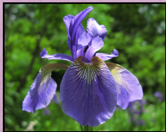
Ayame ( Iris sanguinea )